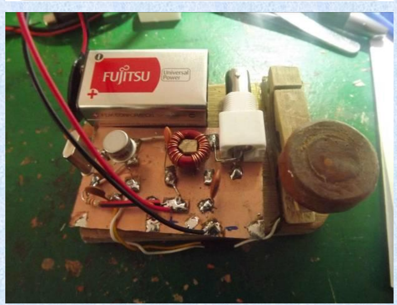
Note by SV8CYR: construct it and with the voltage 18Volt the output was 1Watt. With 9Volts 360 mW in 50\Omega\mu dummy load. Transistor is 2N3866. I test and I changed trimer capacitors with permanent value C1, C2, C3. I dit not use R2, R3, D1, C6, M1.